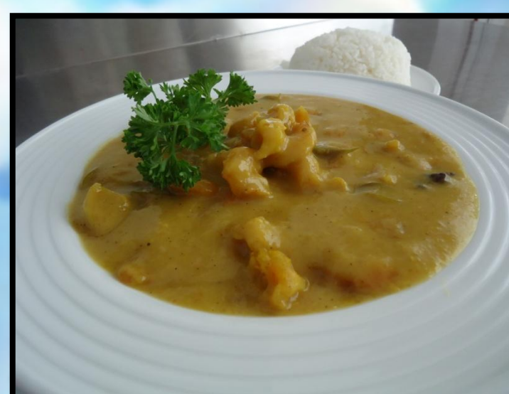
Chicken & Prawn Curry