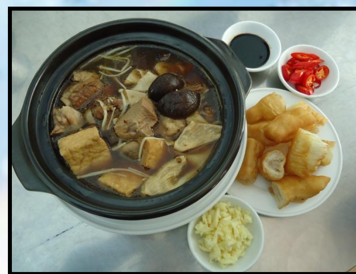
Bak Kut Teh