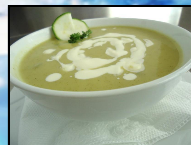
Cold Zucchini Soup