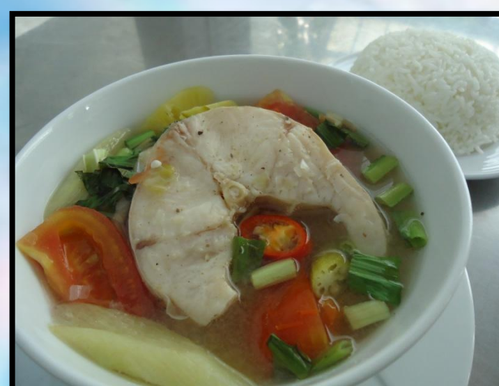
Vietnamese Sweet & Sour Soup