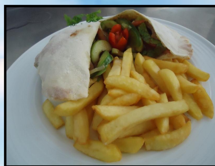
Pita Bread Sandwich