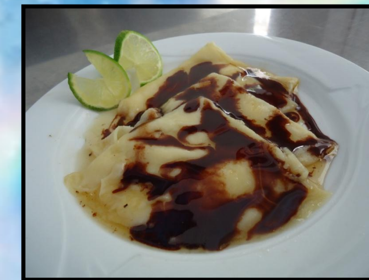
Crêpe with Rum