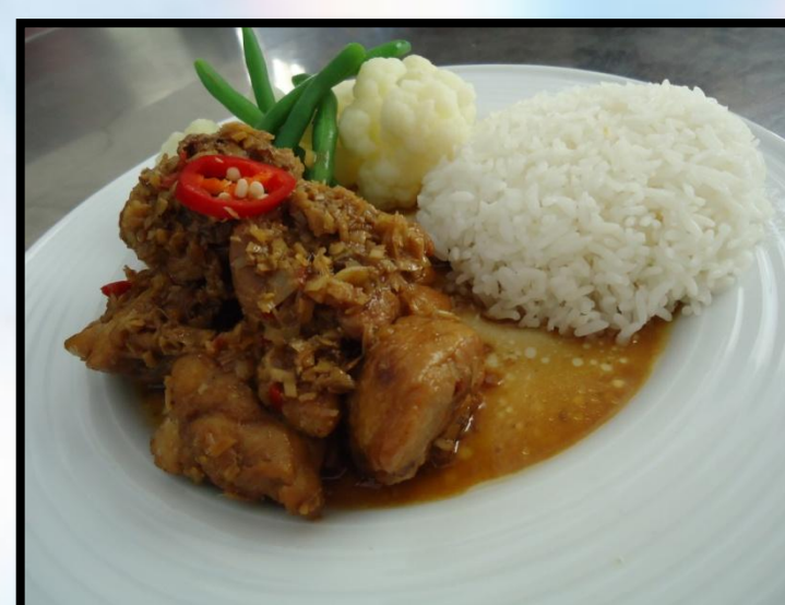
Chicken with Chilli & Lemongrass